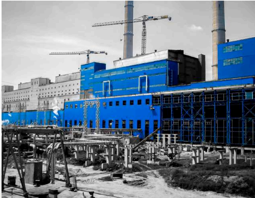
Power Plant, Drobeta, Turnu Severin