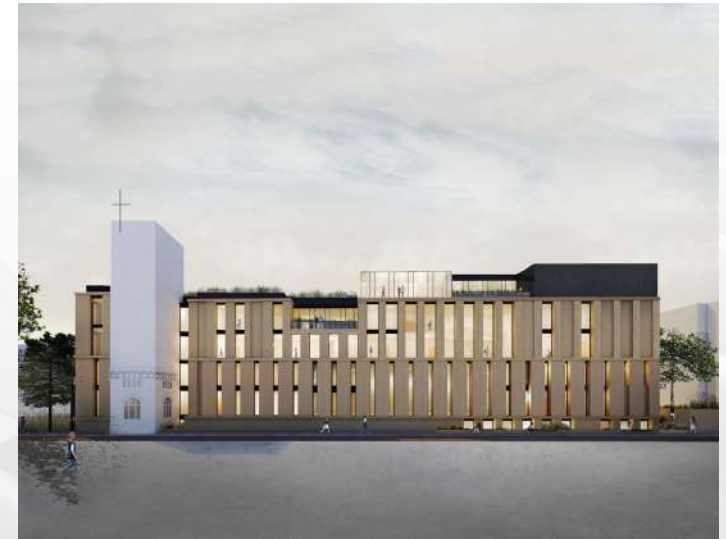
'Mihai Ionescu' Educational Center Bucharest