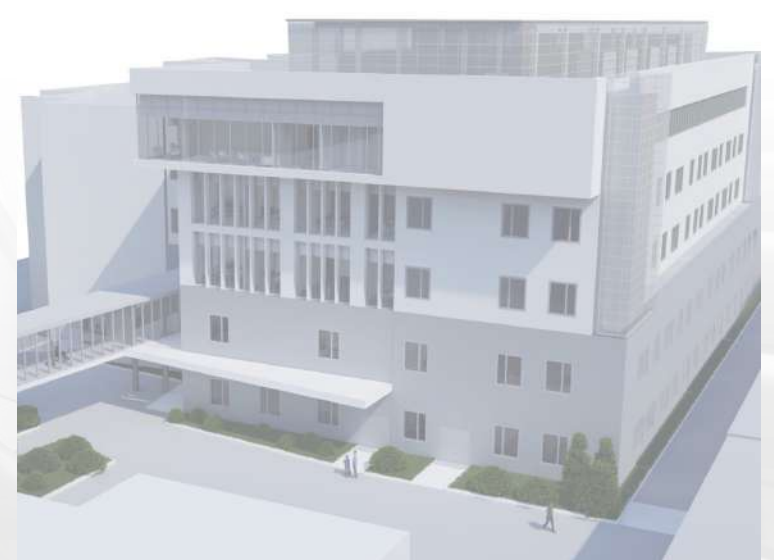
Grigore Alexandrescu Hospital, Bucharest