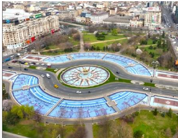
Unirii Square, Bucharest