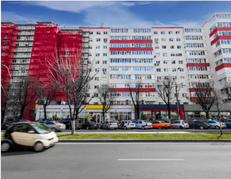
Thermal Rehabilitation of Apartment Buildings

Delivering complex civil works to enhance the well-being of communities across Romania