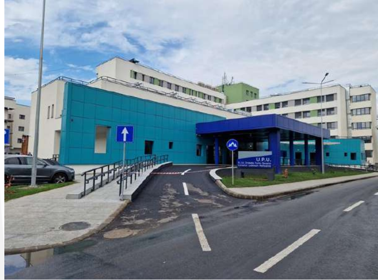
Emergency Receiving Unit Drobeta-Turnu Severin