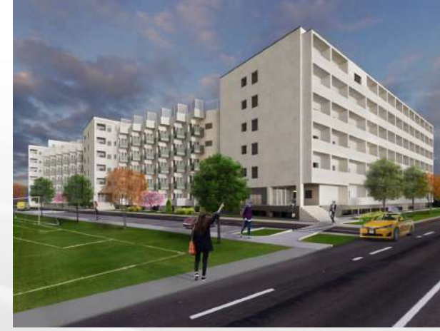
Student dorm - West University of Timisoara