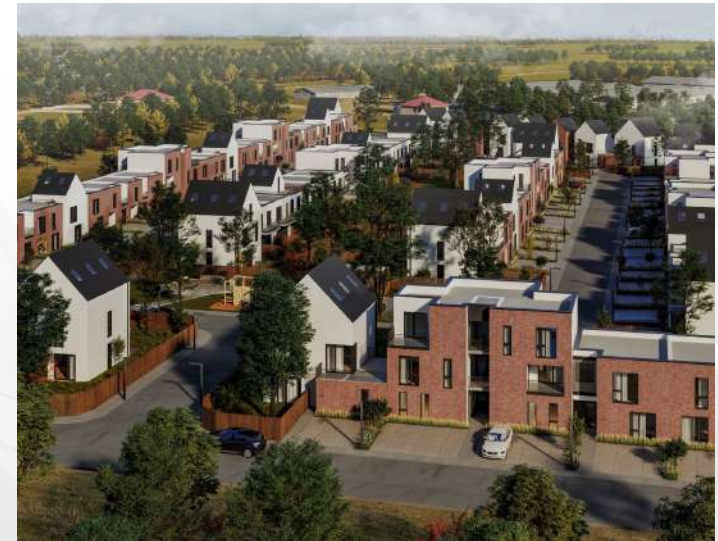
Colina Lac, Bucharest