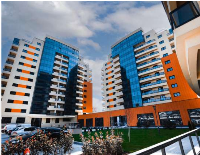
Orhideea Complex Gardens, Bucharest

Creating new homes to enhance the well-being of local communities across Romania