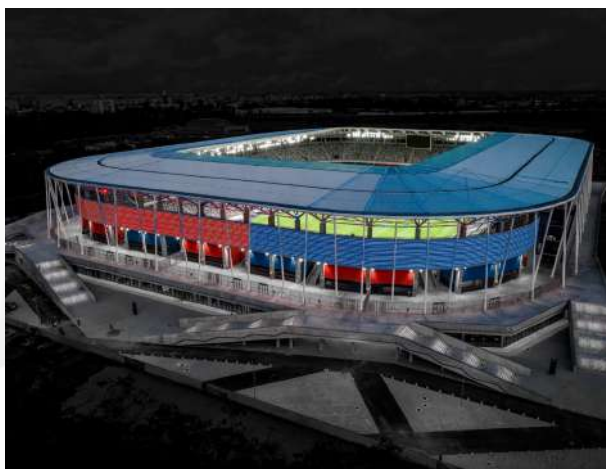
FC Steaua Bucharest Stadium

Strengthening Romania's infrastructure for sports and recreational centers