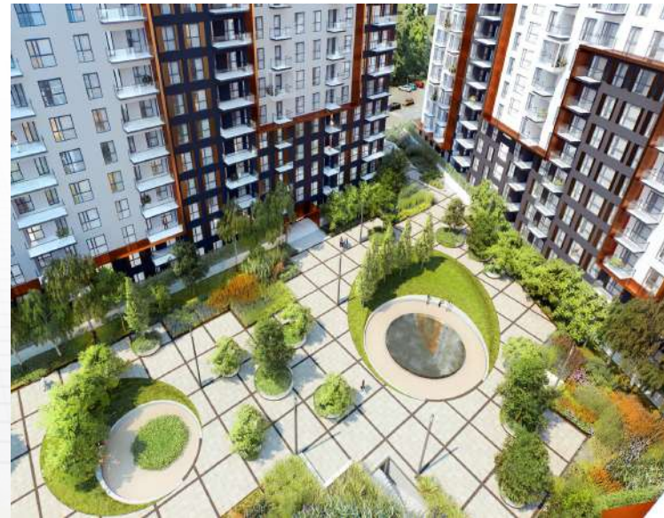
Parcului 20 Residential Complex, Bucharest