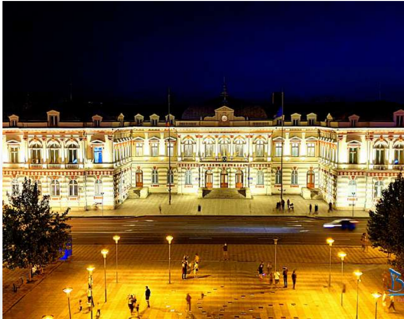
Bacău Administrative Palace

Delivering complex infrastructure works to enhance the well-being of communities across Romania