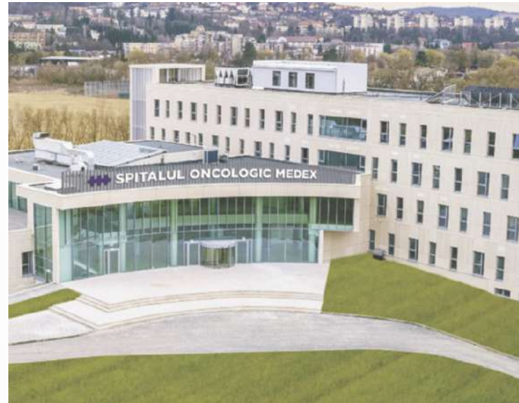
Medex Oncology Hospital, Târgu Mureș