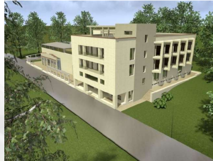
Techirghiol Baleal Rehabilitation Center