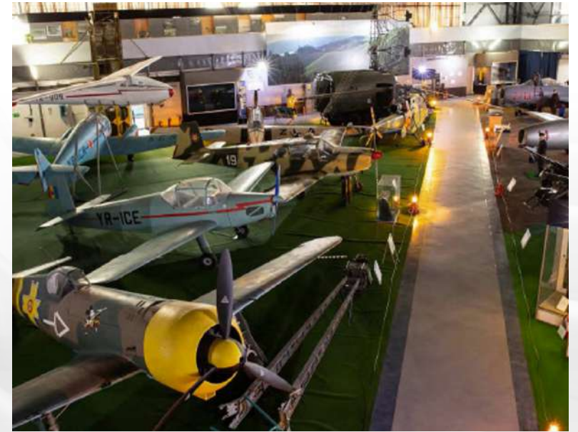
National Romanian Aviation Museum, Bucharest