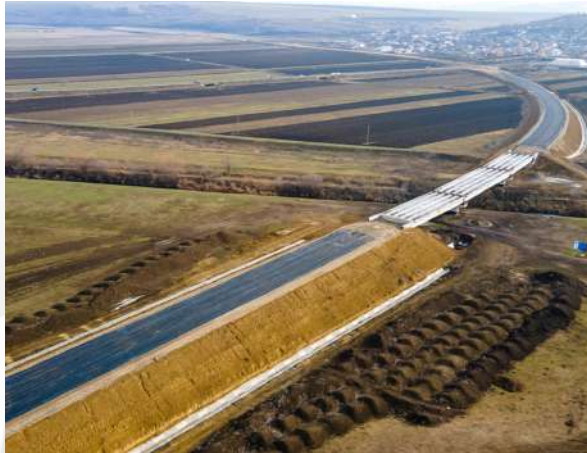
Bârlad by-pass road

Delivering complex infrastructure works to enhance the well-being of communities across Romania