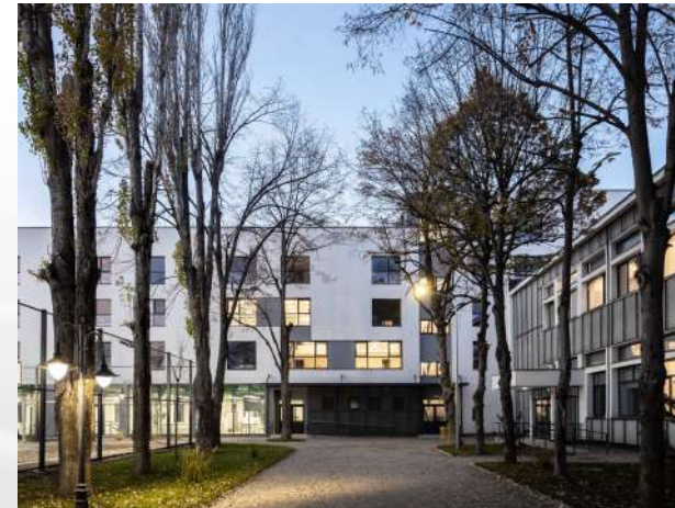
'Miron Nicolescu' Technical College