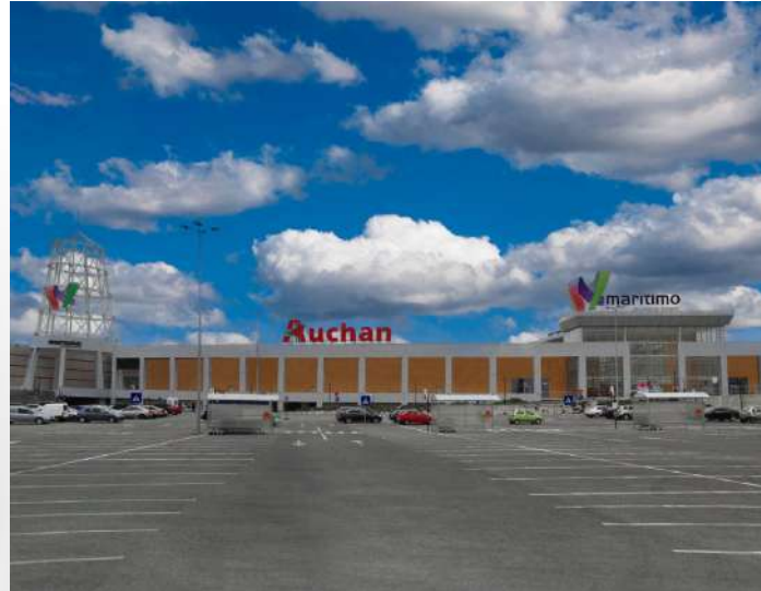
'Maritimo' Shopping Center, Constanta