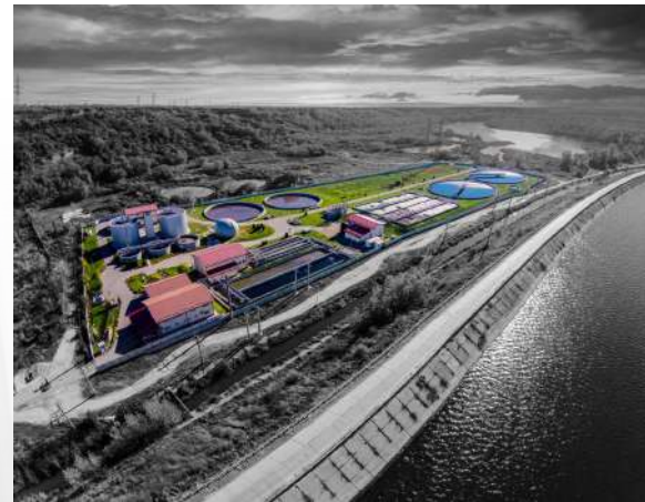
Sf. Gheorghe & Slatina Waste-Water Treatment Plants