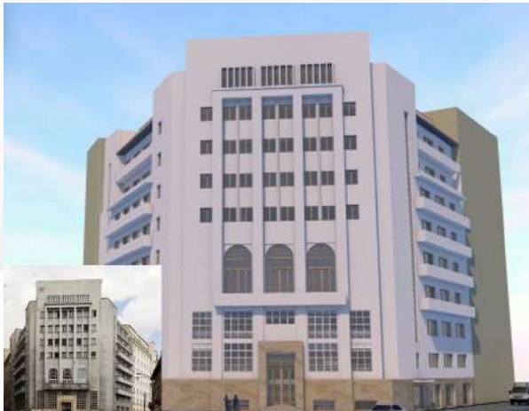
Administrative Building, Bucharest

Strengthening Romania's civil infrastructure with modern and sustainably built constructions