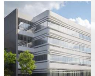
Bucur Maternity Hospital, Bucharest