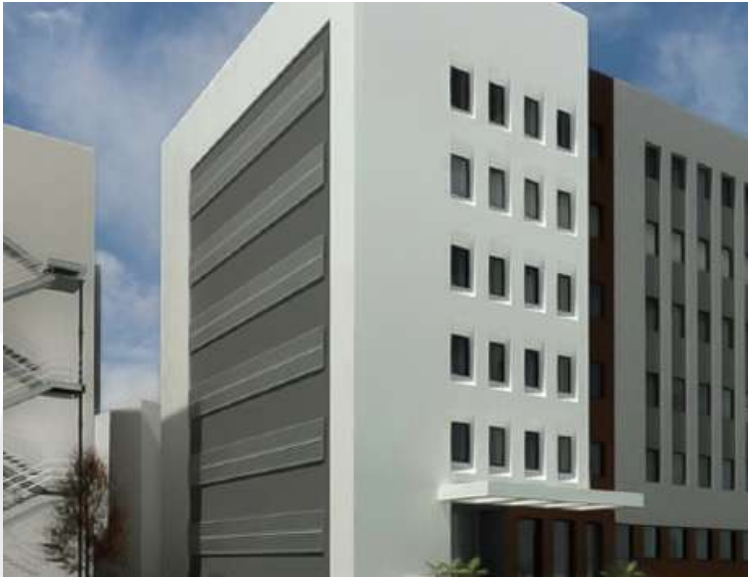
County Emergency Hospital Alexandria

Enhancing Romania's healthcare infrastructure with new hospitals