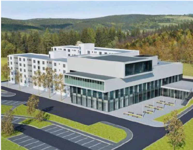
Novum Forum Scientific and Technological University Park, UMFST, Târgu Mureș

Enhancing Romania's healthcare infrastructure with new hospitals