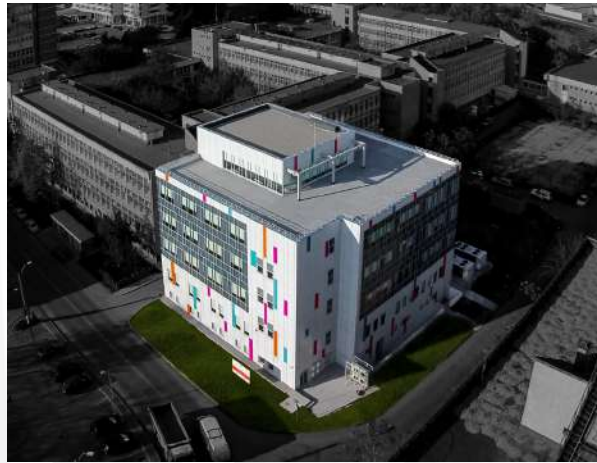
National Institute of Materials Physics