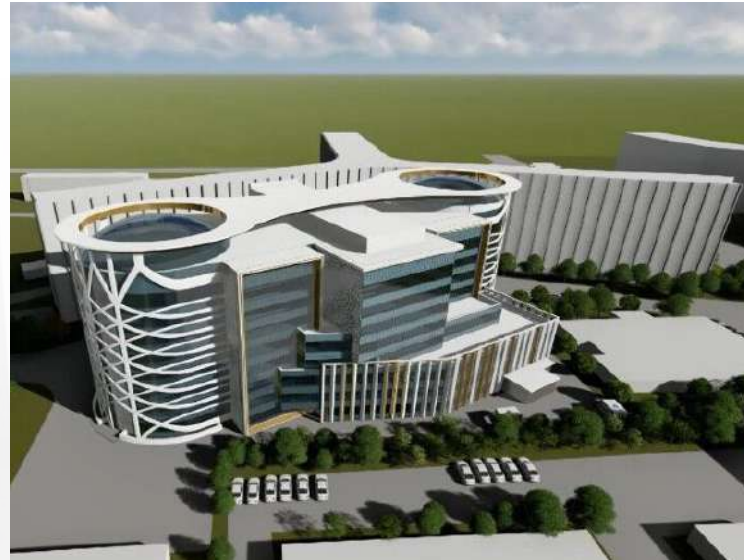
St. Andrew Pediatric Hospital, Constanta