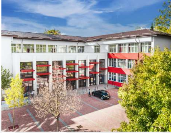
Schools and Kindergartens across Romania