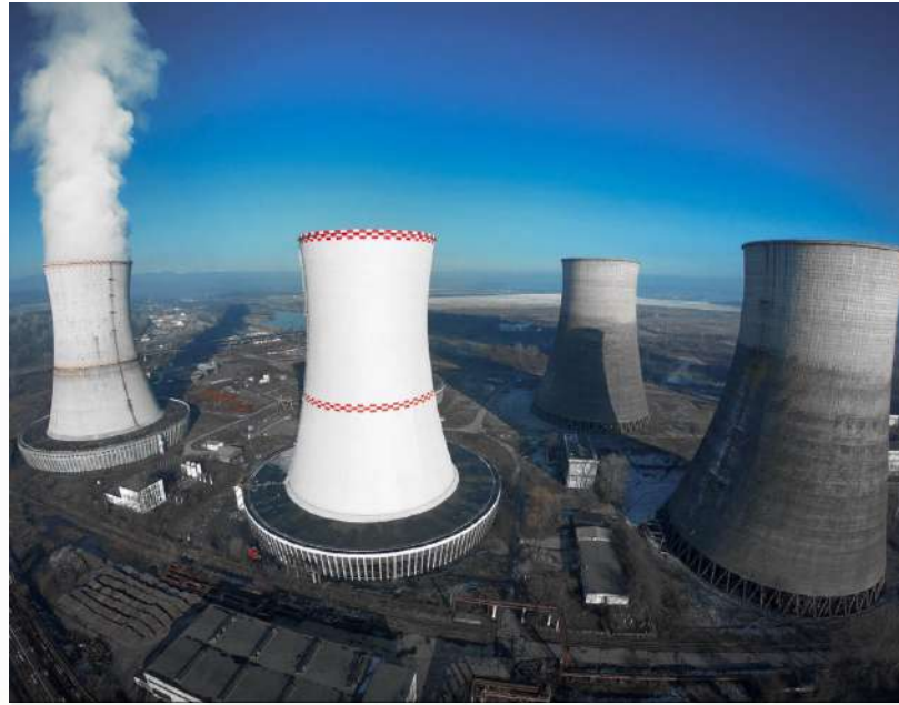
Cooling Towers - Repairs Oltenia Energy Complex