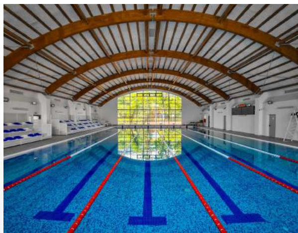
Swimming Pool & Sports Hall Gymnasium School no. 190