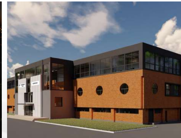
Drobeta-Turnu Severin Olympic Swimming Pool