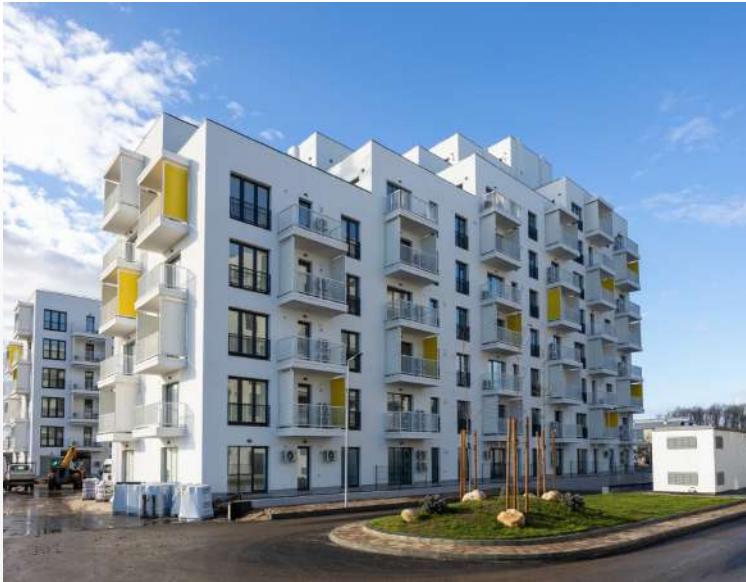
Arbo Residence, Bucharest

Creating new homes to enhance the well-being of local communities across Romania