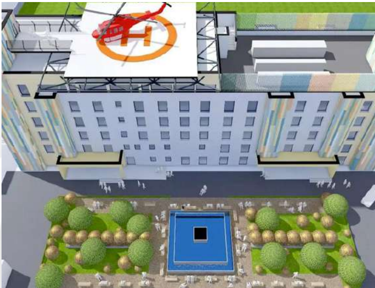
Alba Iulia County Emergency Hospital

Enhancing Romania's healthcare infrastructure with new hospitals