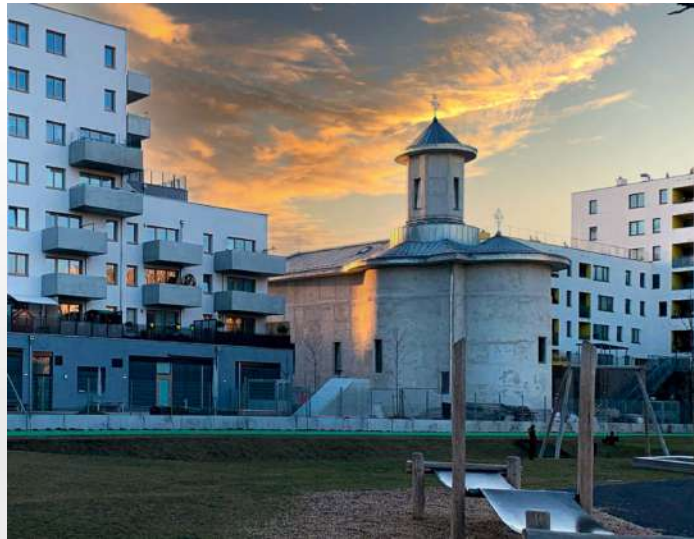
Orthodox Church, Vienna, Austria