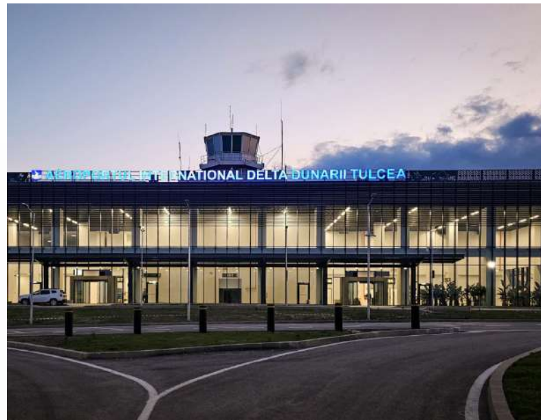
'Danube Delta' International Airport, Tulcea