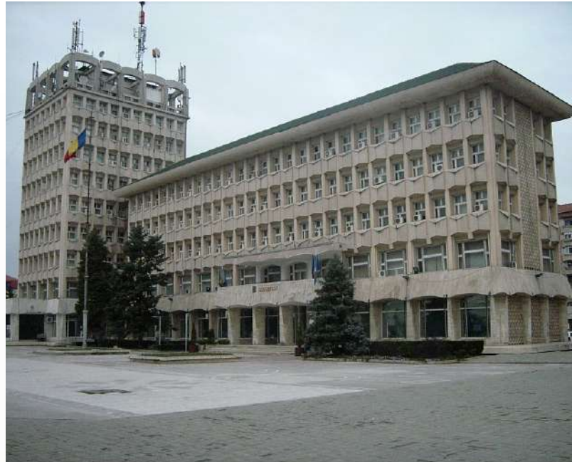
Dâmbovița Administrative Palace