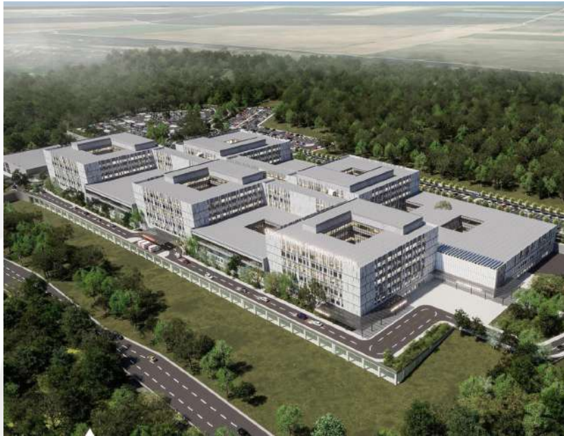
Craiova Regional Emergency Hospital

Enhancing Romania's healthcare infrastructure with new hospitals