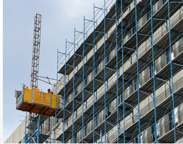
Bucharest Academy of Economic Studies - 'Mihai Eminescu' Building