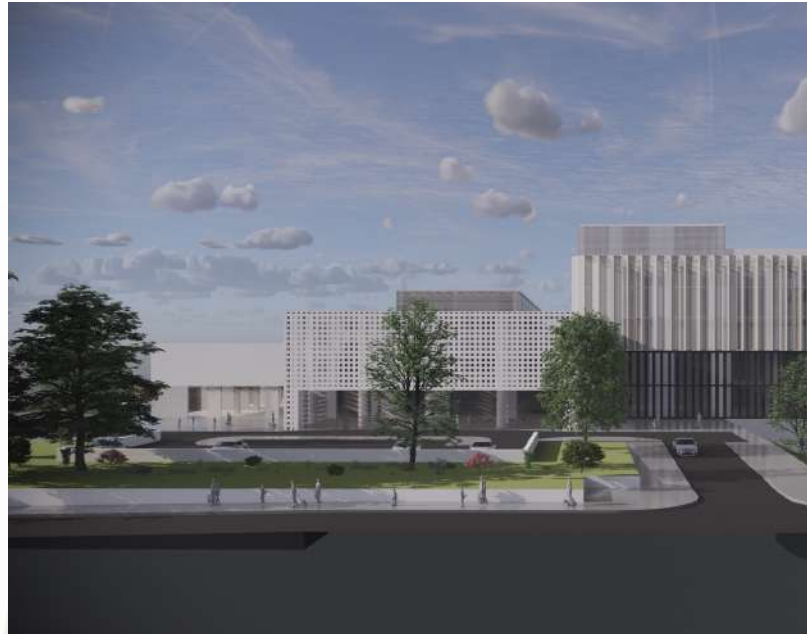
Timișoara Oncology Institute