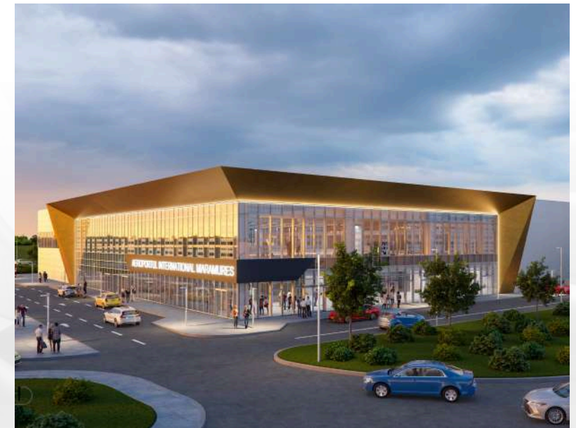
'Maramures' International Airport