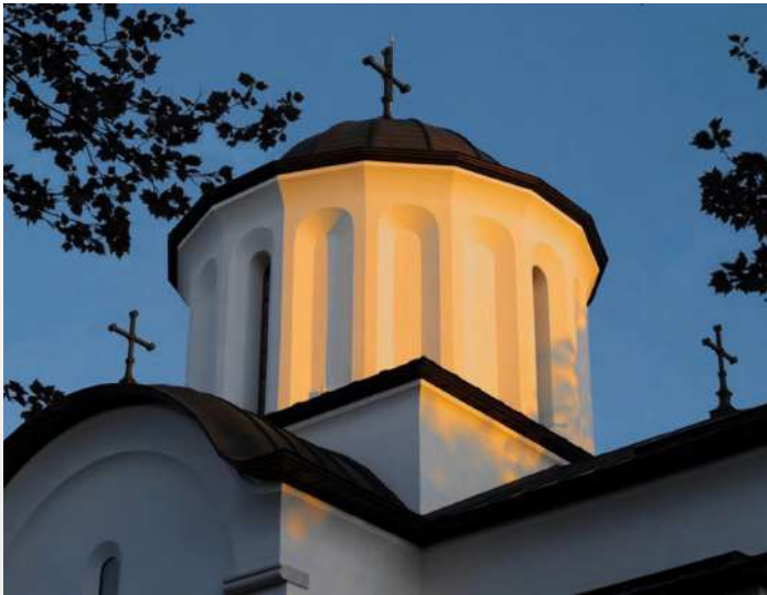
Orthodox Cathedral, Munich, Germany

Preserving and enhancing Romania's cultural heritage locally and internationally