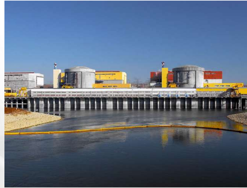
Nuclearelectrica S.A., Cernavoda