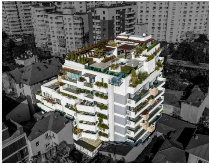
Cuza 99, Bucharest