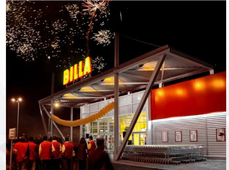
Billa Commercial Network across Romania