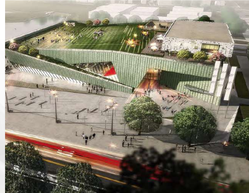
Flamaropol Ice Rink