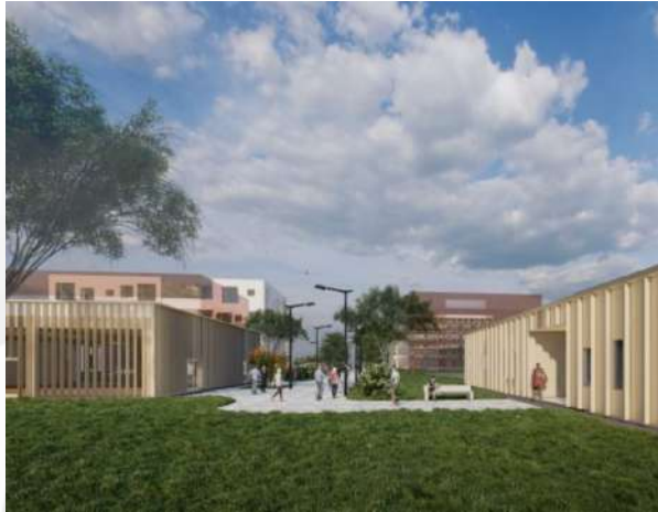
University Campus Vrancea

Strengthening Romania's educational infrastructure by delivering over 70 schools and kindergartens in the past 3 years