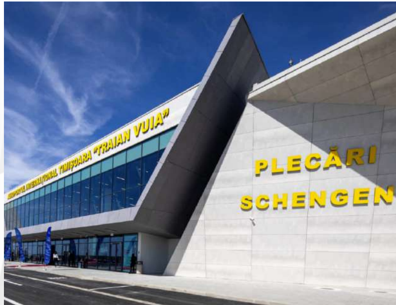
'Traian Vuia' International Airport

Strengthening Romania's airport infrastructure by delivering 3 of the country's busiest airports