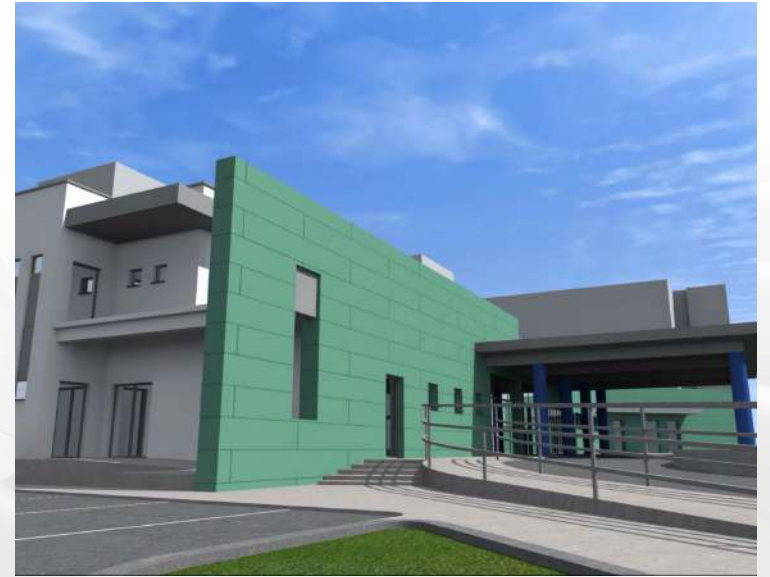
County Emergency Hospital, Drobeta-Turnu Severin