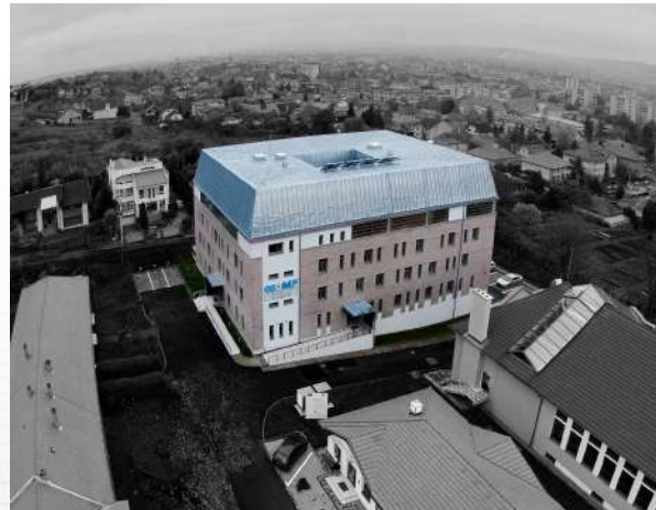
Advanced Center for Medical and Pharmaceutical Research, Târgu Mureș