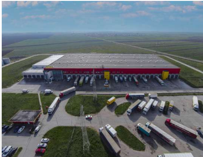
Billa Logistics Center, Prahova county

Building the most modern and best-equipped retail facilities across Romania