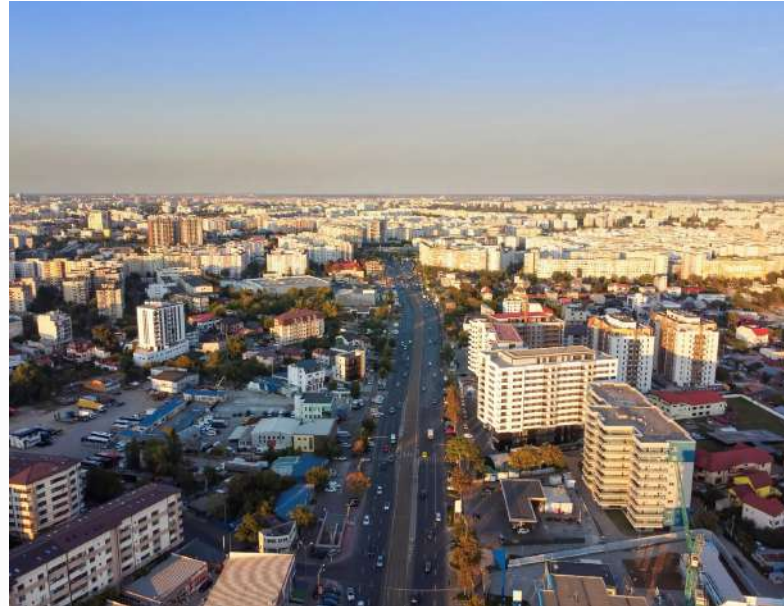
Regeneration of public spaces, Bucharest